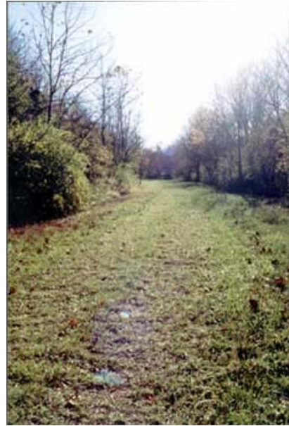
Mt. Sterling – rail bed