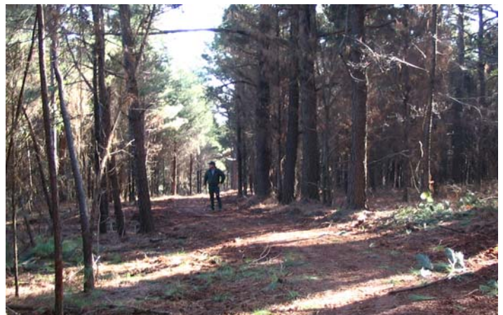
(View of the Mammoth Cave RR Bike & Hike Trail,)