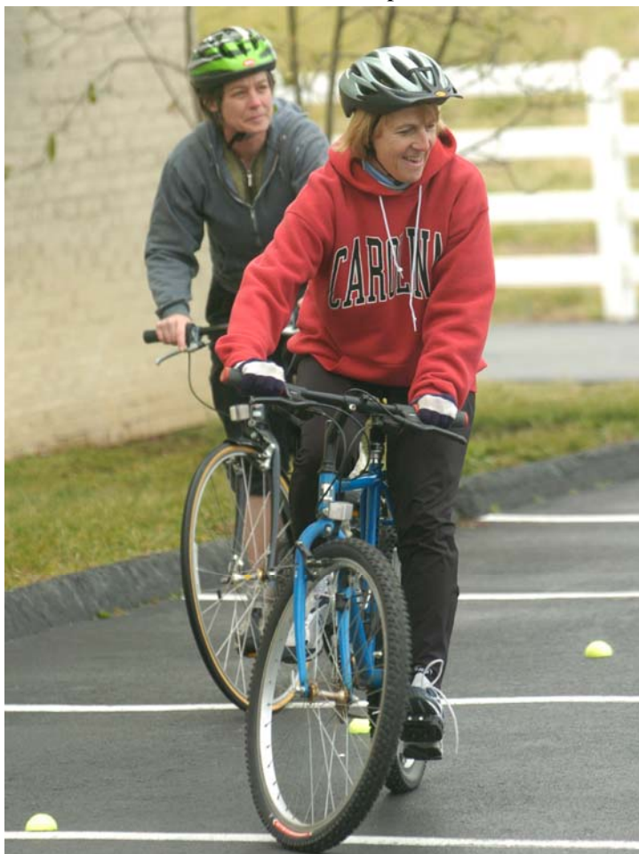
(Students in the Bike Education Class at the 2006 KRTC Conference.)