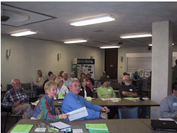
(LBS Workshop, Morehead, 4/1/06, K. Lovan)