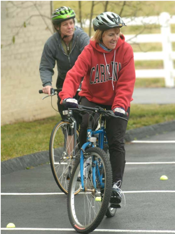
(Students in the Bike Education Class at the 2006 KRTC Conference.)