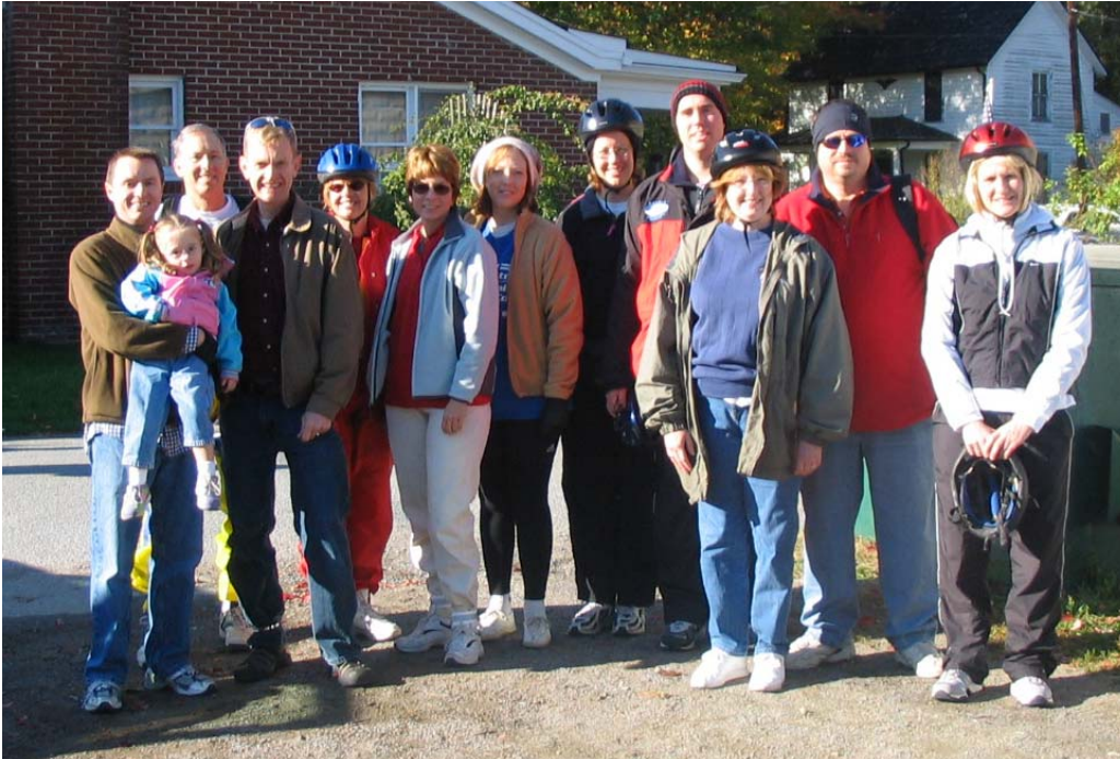
(KRTC Members and supporters on their Trip to the Virginia Creeper,)