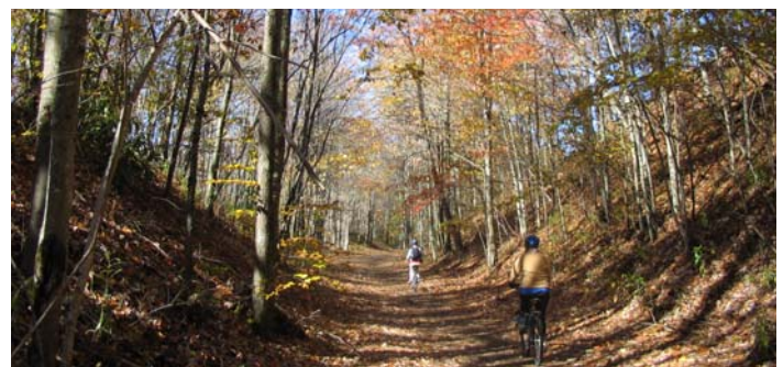
(Virginia Creeper Trail,)