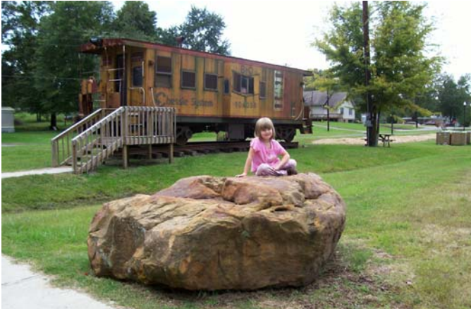
(A RT supporter sits on her favorite rock at the White Plains rail trail.)

The Pennyrile Area Cyclists of Madisonville and Hopkins County hosted a Family Fun Ride in White Plains on September 30. The eleven mile road ride was held to attract new and beginning riders, to promote the local 1.5 mile rail trail, to stir interest in community involvement for the expansion of this trail and to raise awareness about other trails in Kentucky as well as neighboring states. We accomplished all these goals, including the inspiration for PAC to join KRTC as a Member Organization. Par-