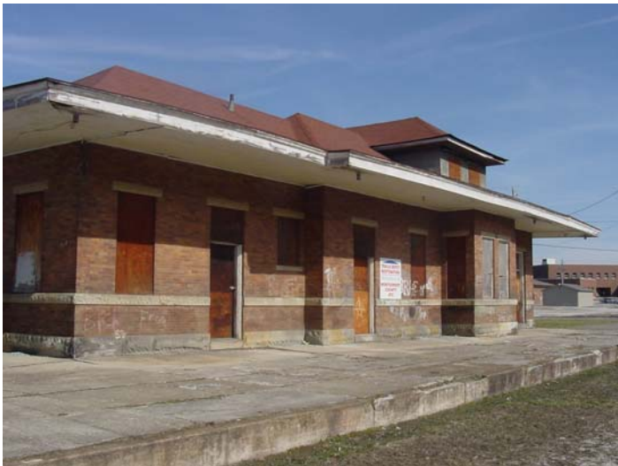
(Mt. Sterling Depot,)