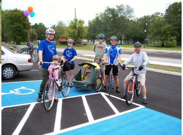
(A sampling of Family Fun and rail trail riders at White Plains,)